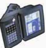
8" Touch Screen Terminal 8寸触屏显示器