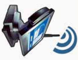
Wireless Touch Screen Terminal 无线 触屏显示器