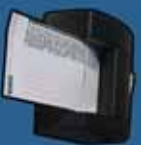
Dim-Sum Ordering System 点心入单系统