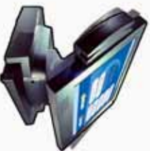
15" Touch Screen Terminal 15寸触屏显示器