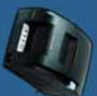
Impact Printer 撞击式打印机