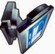
12" Touch Screen Terminal 12寸触屏显示器