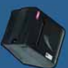
Thermal Printer 超高速热敏 打印机