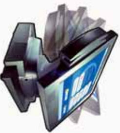
19" Touch Screen Terminal 19寸触屏显示器