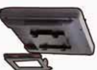
Wall-mounted Touch Screen Terminal 挂墙式 触屏显示器