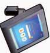
Pole - mounted Touch Screen Terminal 柱焊式 触屏显示器