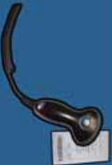
Delivery Management Barcode Scanner 送餐扫描器